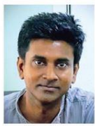
E-FutureTech Systems (Pvt) Ltd ප්‍රධාන විධායක නිලධාරී අපේක්ෂකයන්

අත්හැරියාලු සම්බන්ධතාවයන් රහිත රැකියා අපේක්ෂකයන්ට හා ප්‍රථම 100% ක්, පැහැදිලි කරනුයේ කාර්යයන් සේවා සපයන ශ්‍රී ලංකාවේ එනම රැකියා නොලැබී. E-FutureTech Systems (Pvt) Ltd හි ප්‍රධාන විධායක නිලධාරී අපේක්ෂකයන් මගින් අදාළ රැකියාවක් සොයා ගැනීමට හැකියාවක් ඇති බව කොපයෙන්. එසඳුම් Jobpal.lk. ශ්‍රී ලංකාවේ පළමු වරට රැකියා සොයන්නන්ට ප්‍රමුඛත්වය වර්තමාණයේ, ශ්‍රී ලංකාවේ පවතින වෙනසක්ම වැඩිමන රැකියා දෙපාර්තමේන්ට අනෙකුත් ප්‍රතිමල්ලවයන් හා සසඳන කළ විනිශ්චිතවයන් අත්කරගෙන ඇත. Jobpal.lk හි සියලුම සේවා යෝජකයන්ට නොමිලේ සේවා සපයන අතර, සමූහ මොහොතකින් අත්හැරගනුයේ සභාපතින් ලෙස ඒ හා කවුලුවේ. කව ද එය